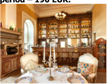
Address: Kutuzovsky prospect, 2/1