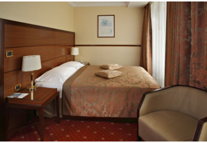
Address: 5 Smolenskaya Street

Number of rooms/floors: 293/22 Year built/reconstructed: 1971/2013 Nearest metro station: Smolenskaya